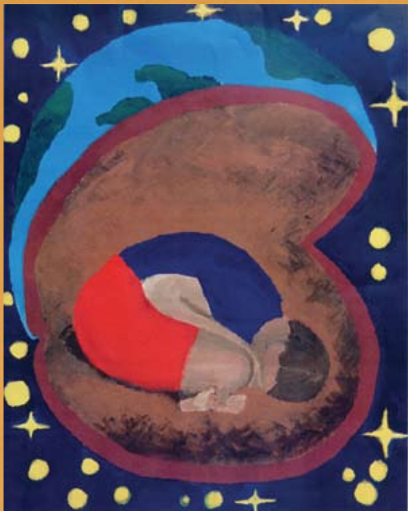
Kylar, 21 EOC Sanctuary Fresno, CA