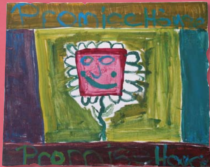
Richelle Promise House Dallas, TX

So many faces, that come and go. People whom you, Don't even get to know. It's almost as if, They want us to be, Thinking of our issues, In solitary.