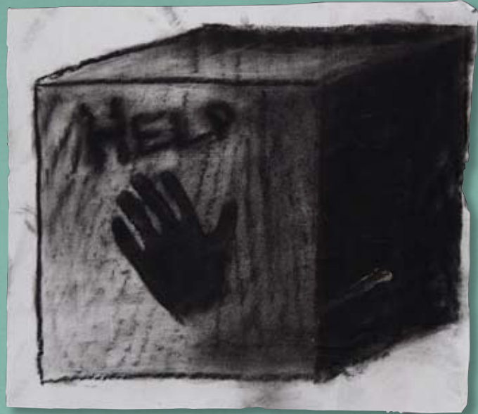
Anonymous YMCA Safe Place Services Louisville, KY