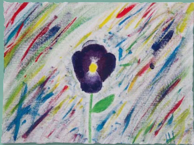
Anonymous YMCA Safe Place Services Louisville, KY