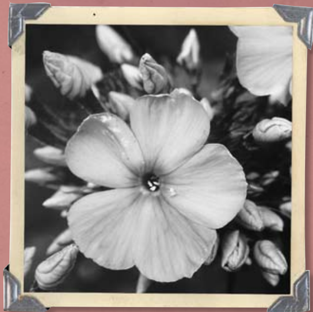
Presley, 15 "An Unexpected Guest" YSB Safe Station Mishawaka, IN