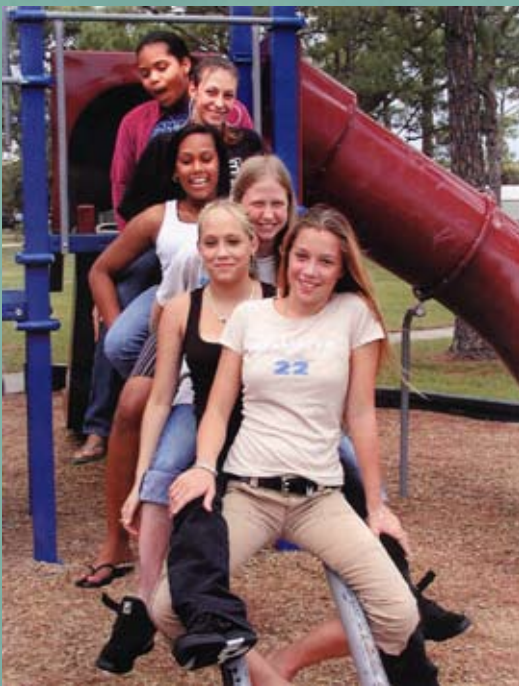
"Girls Just Want to Have Fun" Crosswinds Youth Services Cocoa, FL