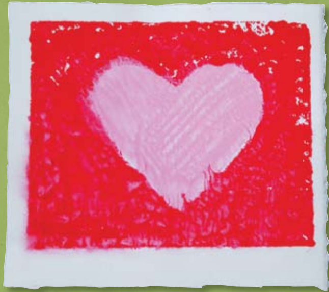
Essence, 17 YMCA Safe Place Services Louisville, KY